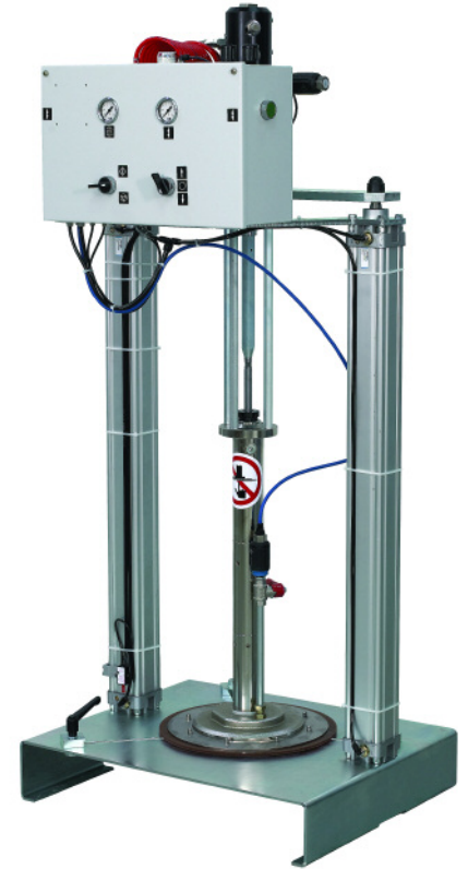
DOPAG P80 drum pump

Little wonder then, that when the company was looking for systems to pump and